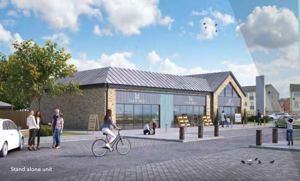
Stand alone unit